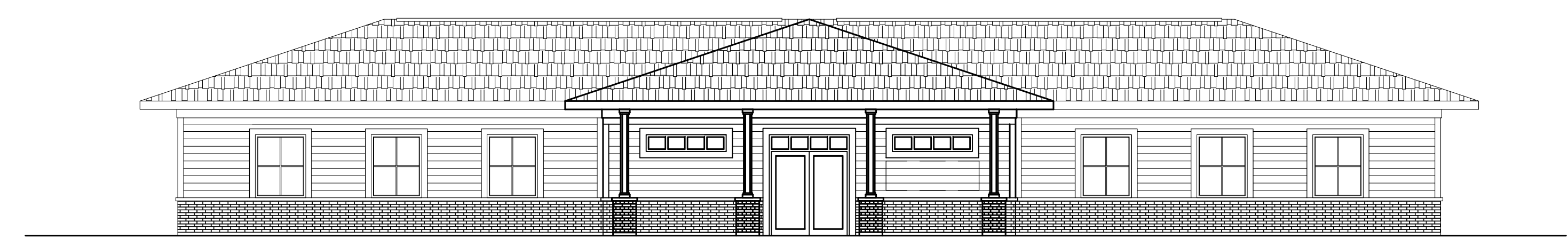
NORTH ELEVATION SCALE: 1/8"=1'-0"